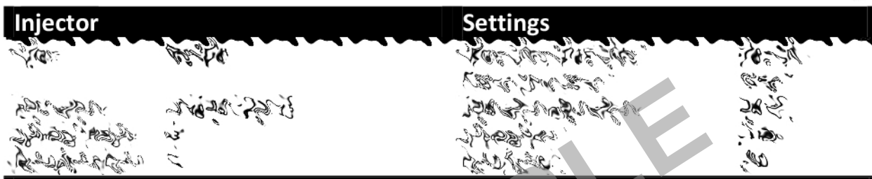
Massfraction of collected volume